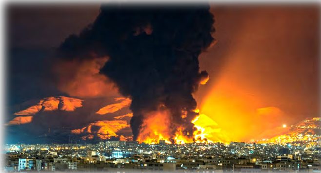
Source: Mother Jones , March 11, 2026, The Bombing of Iranian Oil Facilities is Causing a Health and Environmental Nightmare AFP/Getty

Over 3,000 people have died in the Iran war. The electric grid failed in Cuba primarily because of the lack of oil, and there was an unheard-of violent protest. People were