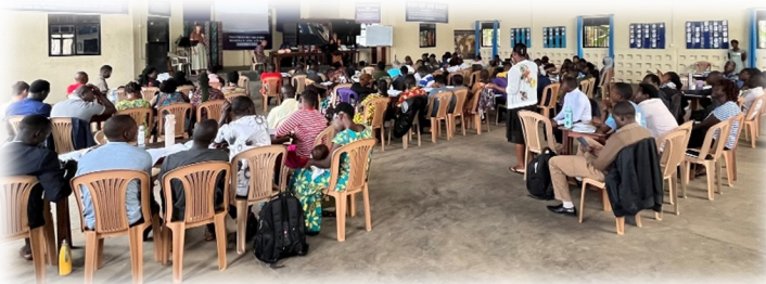
East African missionaries take a week of medical skills training in Tororo, Uganda, last July.