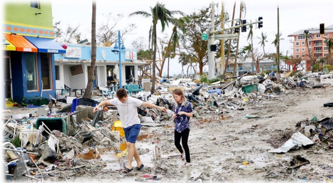
Ft. Myers Beach after Hurricane Ian

Most are familiar with the consequences of our warming oceans – extreme hurricanes, typhoons and the kind of rainstorms California experienced in January. These warmer