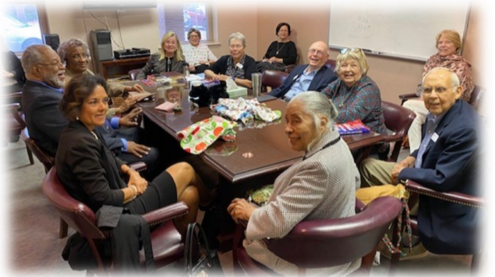
Combined Trinity United /Faith Presbyterian Bible Study at Faith Presbyterian Church, Tallahassee

What does it look like for a historically white PCUSA church to "build the Beloved Community" with their local Christian siblings of color? It happened when a Sunday School class at Faith Presbyterian in Tallahassee reached out to establish a bond with the local historically black PC (USA) church, Trinity United Presbyterian Church. Trinity's history is a story of a gospel-living,