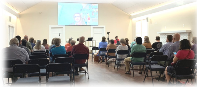
First Presbyterian of Tallahassee’s very varied “Inquirers” gather in a hybrid format