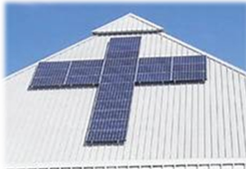
Presbyterian Church, Elko, NV

Instead, I woke up recently to the Intergovernmental Panel on Climate Change Sixth