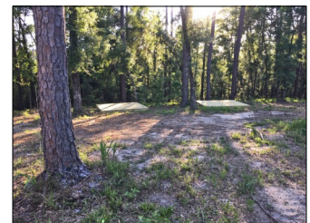
New tent pads are ready