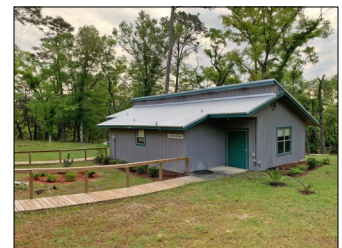
Landscaping completes the picture