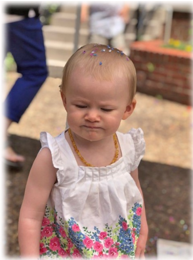
Cascarones! The traditional Mexican confetti-filled eggshells shower celebratory confetti