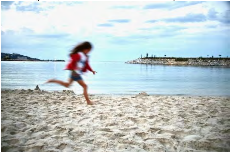
Varya races across the beaches of Bulgaria in the summer of 2023

Here are some images from our work. At the bottom is my bio.