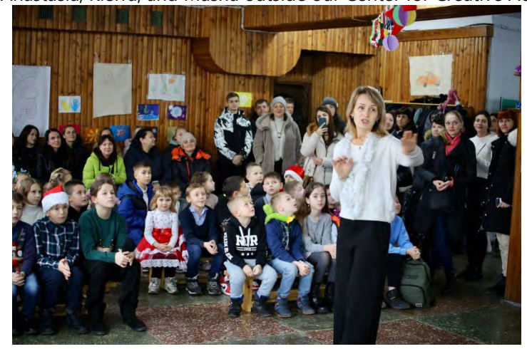
Christmas party for children.